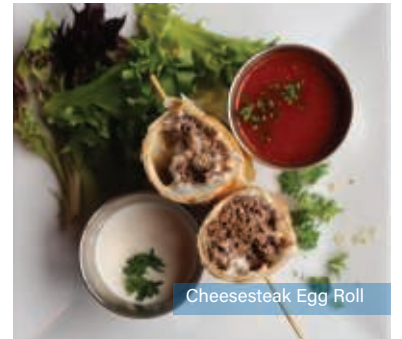
Cheesesteak Egg Roll