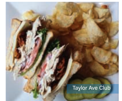
Taylor Ave Club

HAVE A PARTY AT DOGTOOTH OR YOU HAVE THE PARTY AND WE'LL BRING THE FOOD!