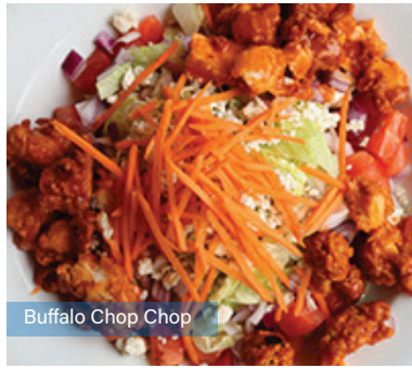
Buffalo Chop Chop