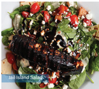
Jail Island Salad