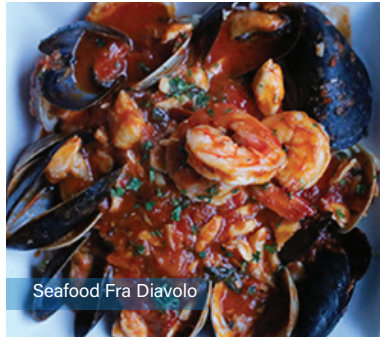
Seafood Fra Diavolo