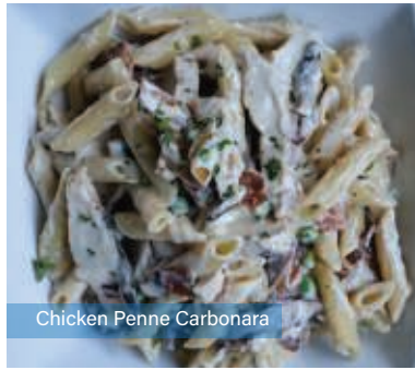
Chicken Penne Carbonara